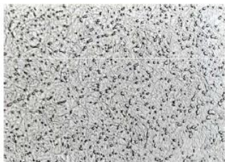
Cronidur® 30 , Magnification 1000x

Hardenable nitrogen-doped martensitic stainless steel, whose production via the PESR (Pressurised Electro Slag Remelting) process ensures high inclusion cleanliness. The nitrogen gives it a high hardness value and high resistance to corrosion. The right kind of forging can optimise the structure's uniformity. In addition, this alloy also has excellent toughness and wear resistance.